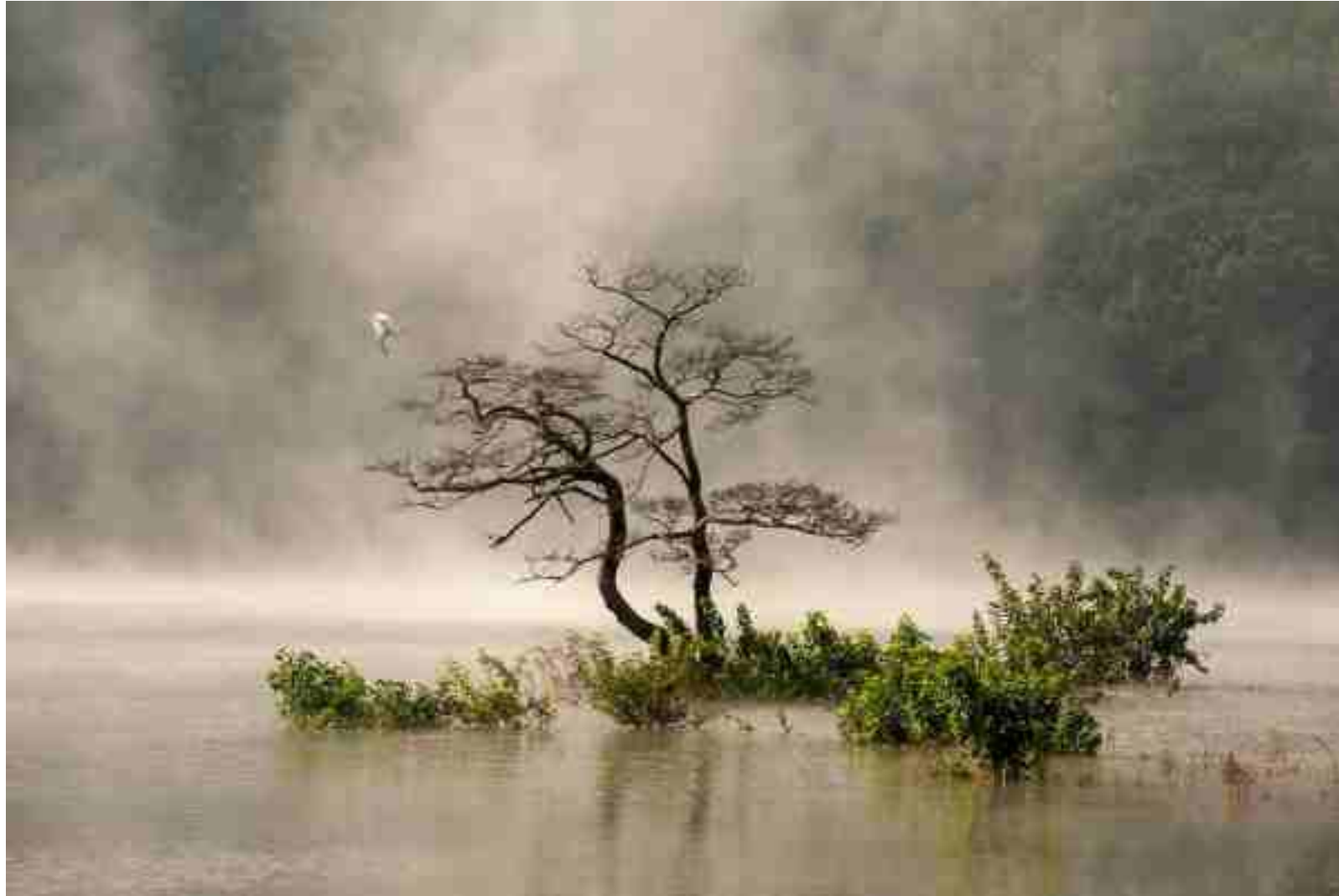
Diploma (PDF) | KOREA PHOTO ART | PHOTO TRAVEL (PTD) (DIGITAL) | Foggy Lake | Sangkyung Sung | South Korea