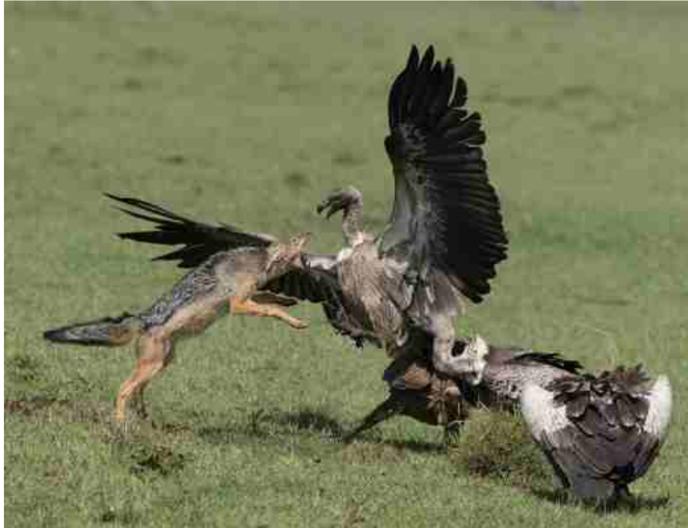
Club Gold | KOREA PHOTO ART | NATURE (ND) (DIGITAL) | Jackal and Vulture Dispute | Ralph Snook | England