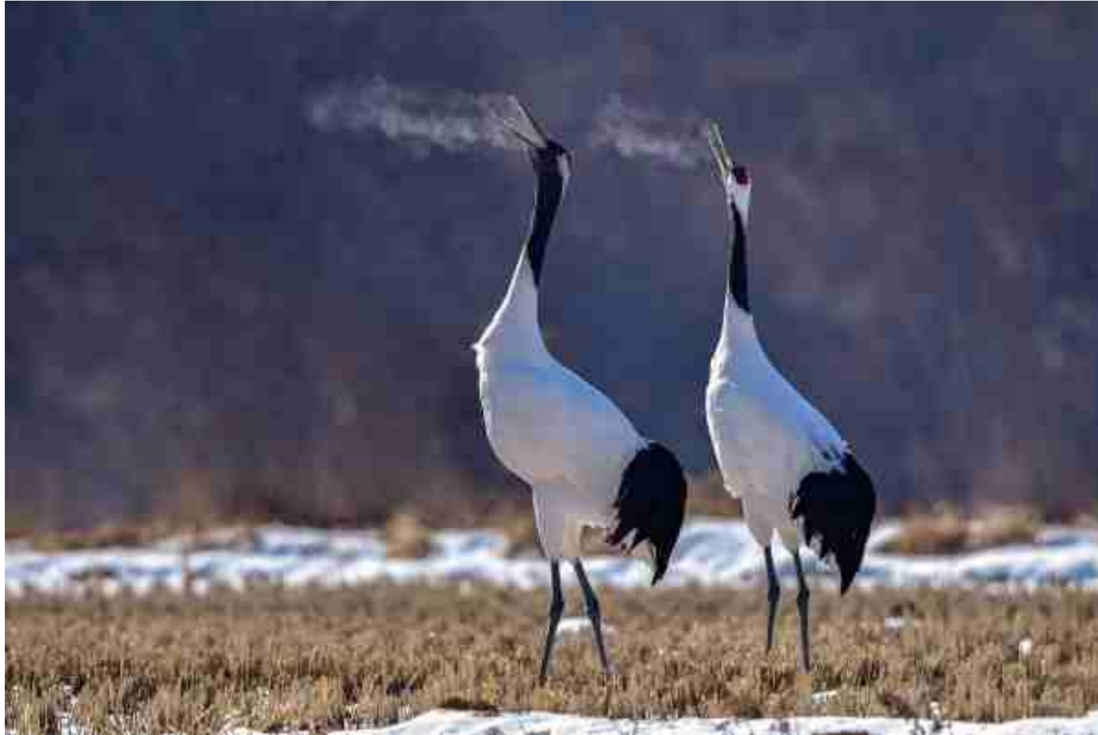
Diploma (PDF) | KOREA PHOTO ART | NATURE (ND) (DIGITAL) | Red-crowned Crane | Kuy Bong Cho | South Korea