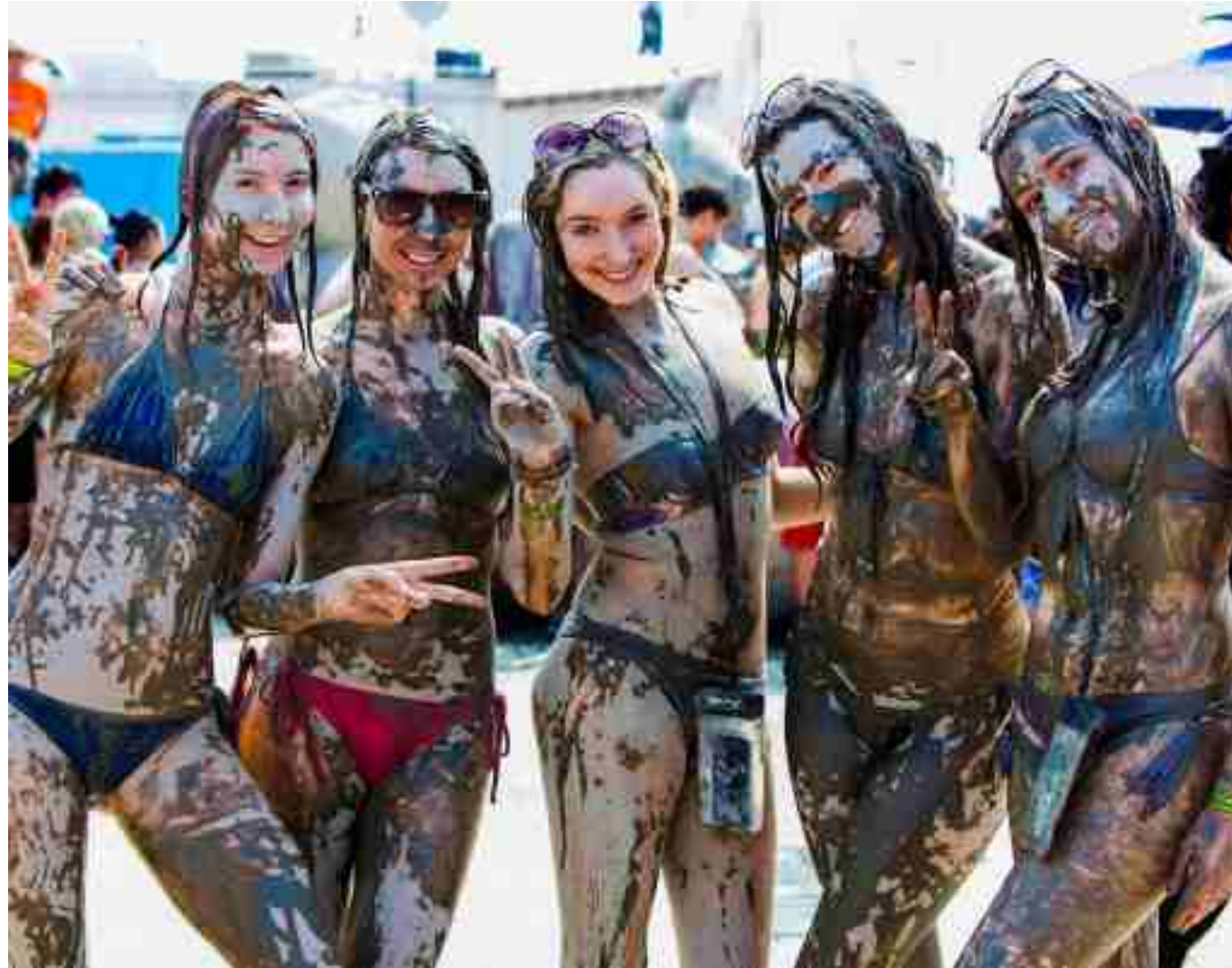
PSA HM RIBBON | KOREA PHOTO ART | PHOTO JOURNALISM (PJD) (DIGITAL) | Boryeong Mud Festival | Aelok Bak | South Korea