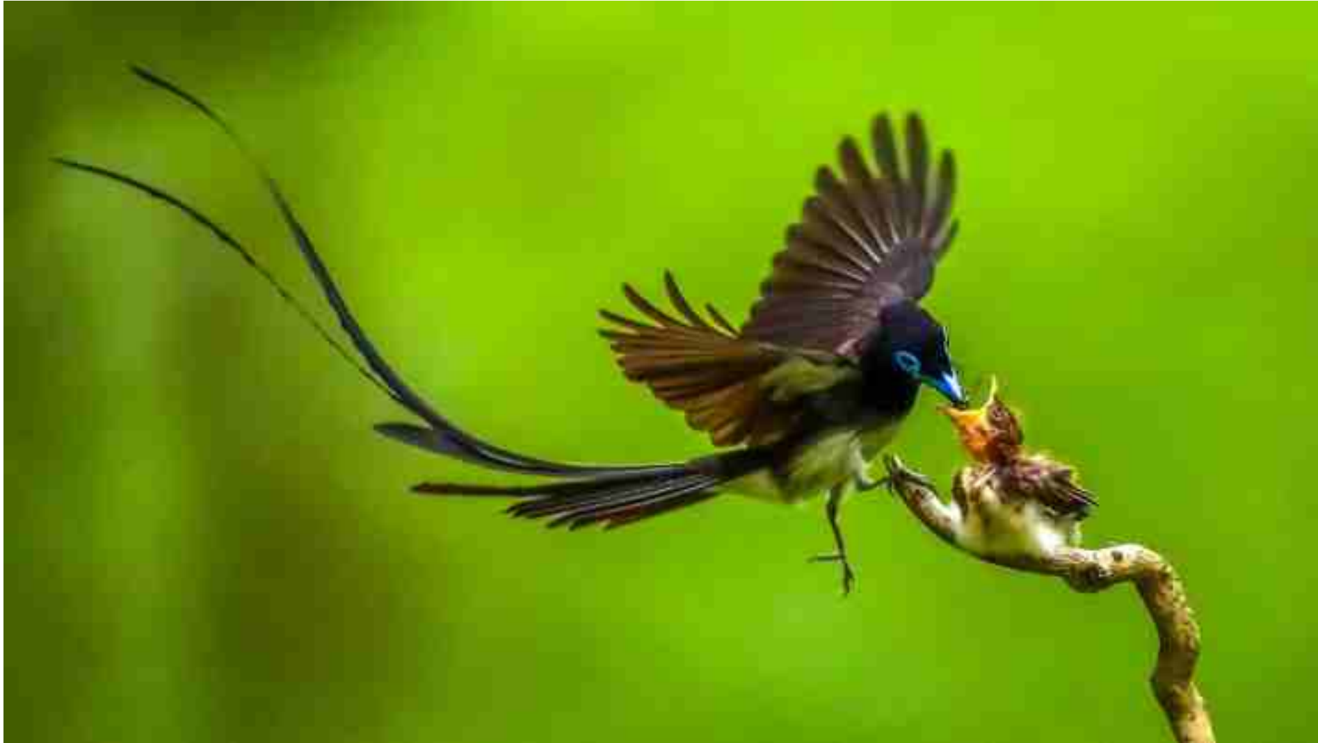
PSA Gold | KOREA PHOTO ART | NATURE (ND) (DIGITAL) | Black Paradise Flycatcher 01 | Taejae Park | South Korea