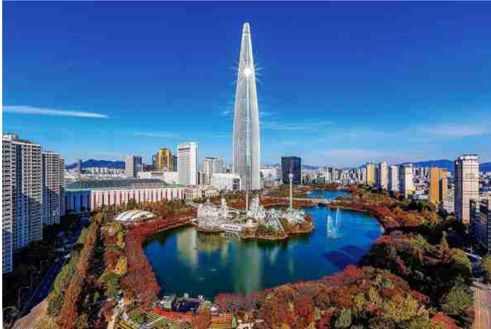
Club Silver | KOREA PHOTO ART | PHOTO TRAVEL (PTD) (DIGITAL) | Autumn at Seokchon Lake | Yoon Shik Yim | South Korea