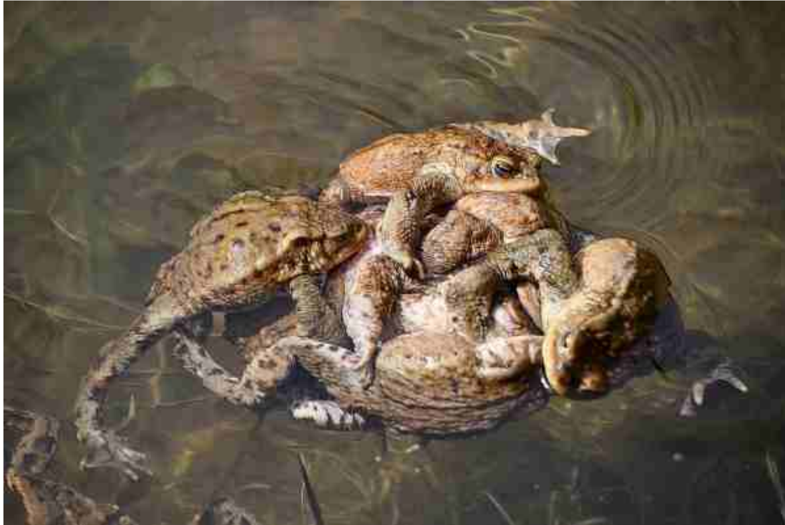
PSA HM RIBBON | KOREA PHOTO ART | NATURE (ND) (DIGITAL) | Kroeten 08-03 | Peter Haeusler | Austria