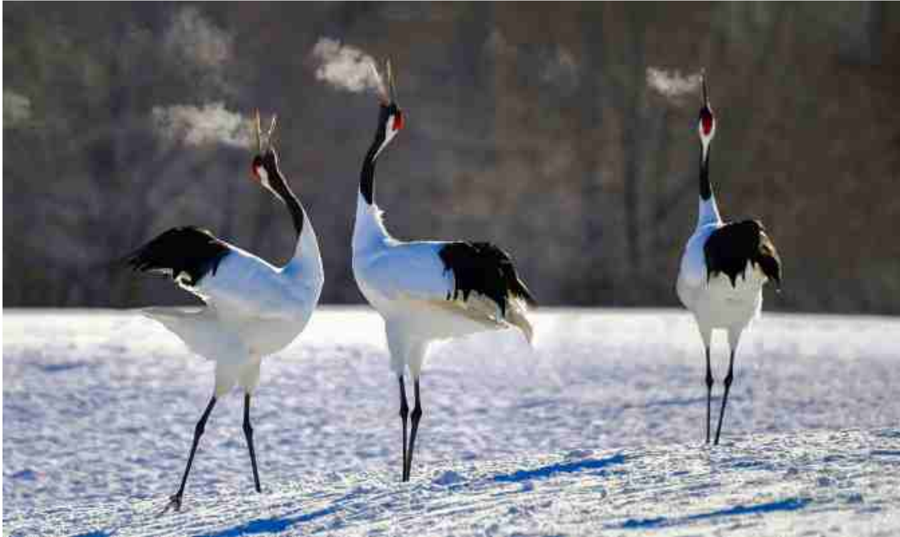
Club Silver | KOREA PHOTO ART | NATURE (ND) (DIGITAL) | Red-crowned Crane 01 | Young Chan Hyun | South Korea