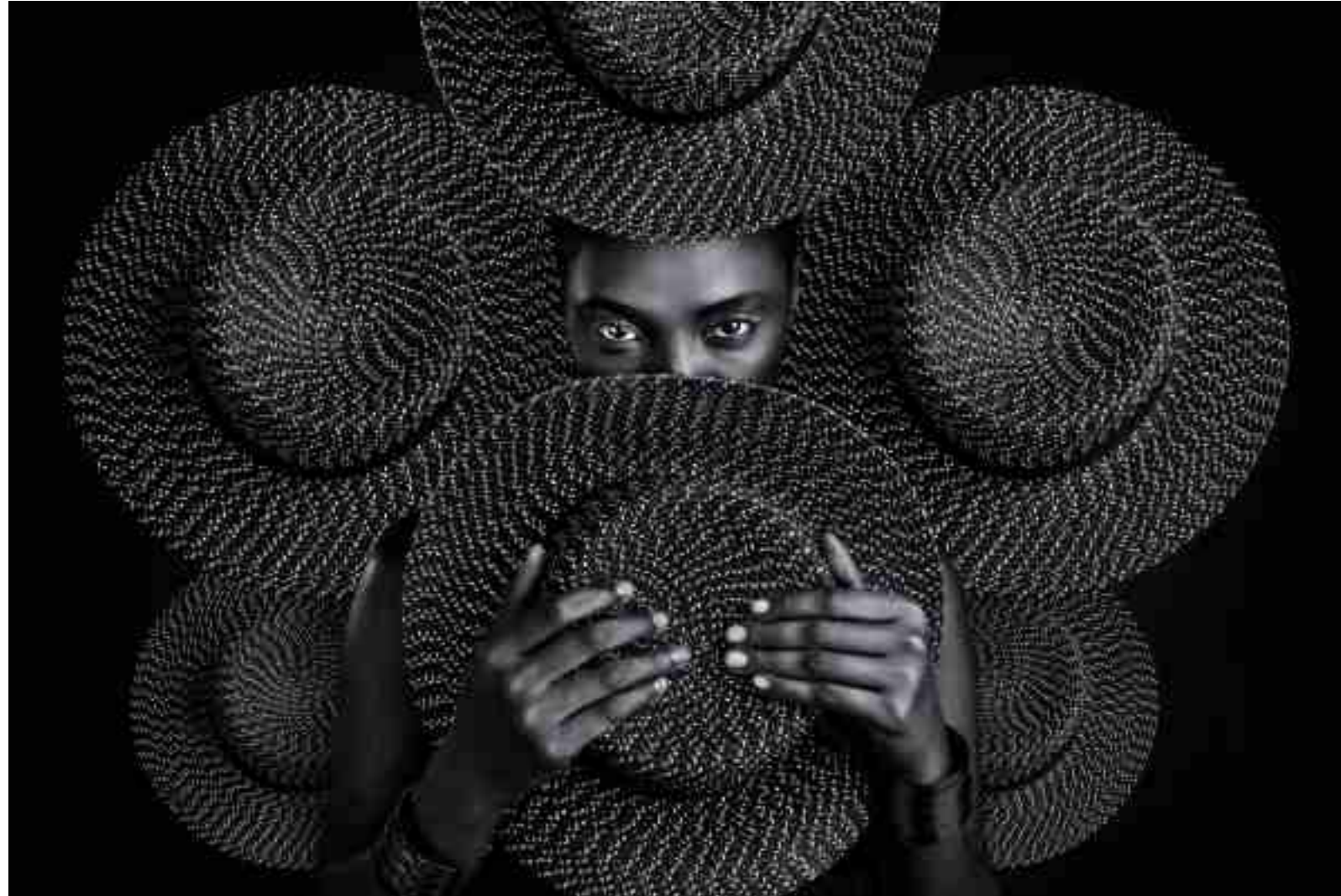
PSA HM RIBBON | KOREA PHOTO ART | MONOCHROME OPEN (PIDM) (DIGITAL) | Black Woman 3 | Im Kai Leong | Macau