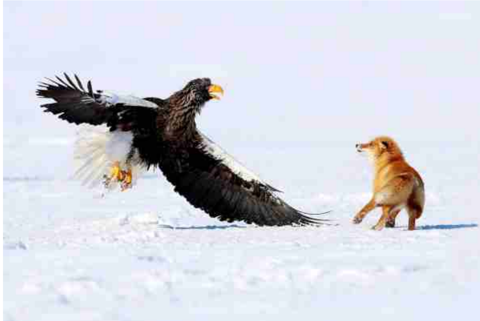
Diploma (PDF) | KOREA PHOTO ART | NATURE (ND) (DIGITAL) | Eagle and Fox | Mi Hee Eo | South Korea