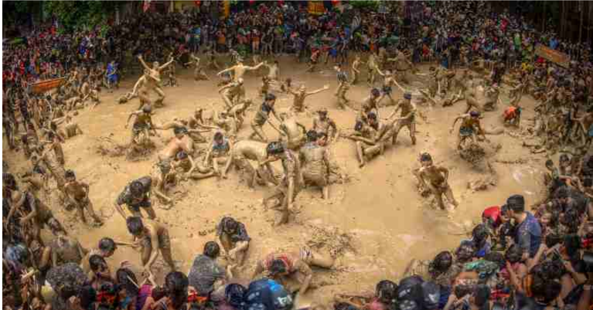
PSA HM RIBBON | KOREA PHOTO ART | PHOTO TRAVEL (PTD) (DIGITAL) | le hoi cau bun Bac Giang | kang duong duy | Vietnam