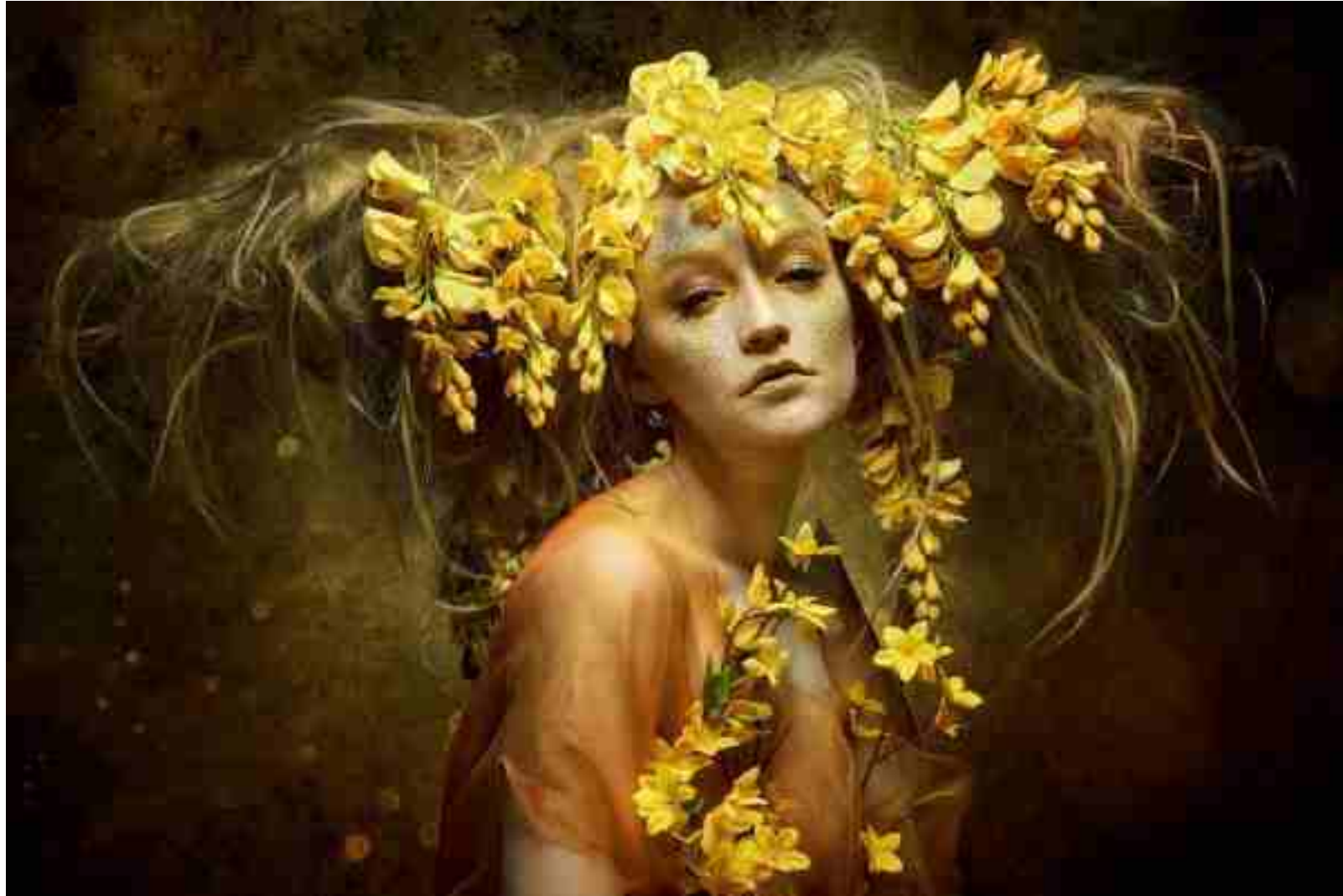
Diploma (PDF) | KOREA PHOTO ART | COLOR OPEN (PIDC) (DIGITAL) | springtime-1 | Manfred Kluger | Germany