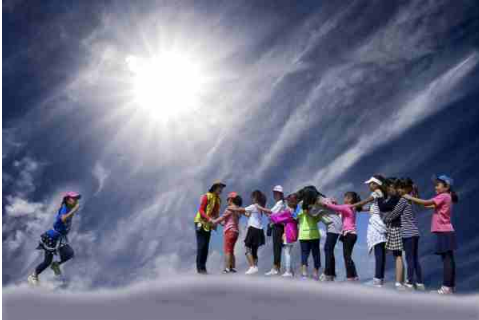
PSA HM RIBBON | KOREA PHOTO ART | COLOR OPEN (PIDC) (DIGITAL) | a chorus of children | Byungkon Kim | South Korea