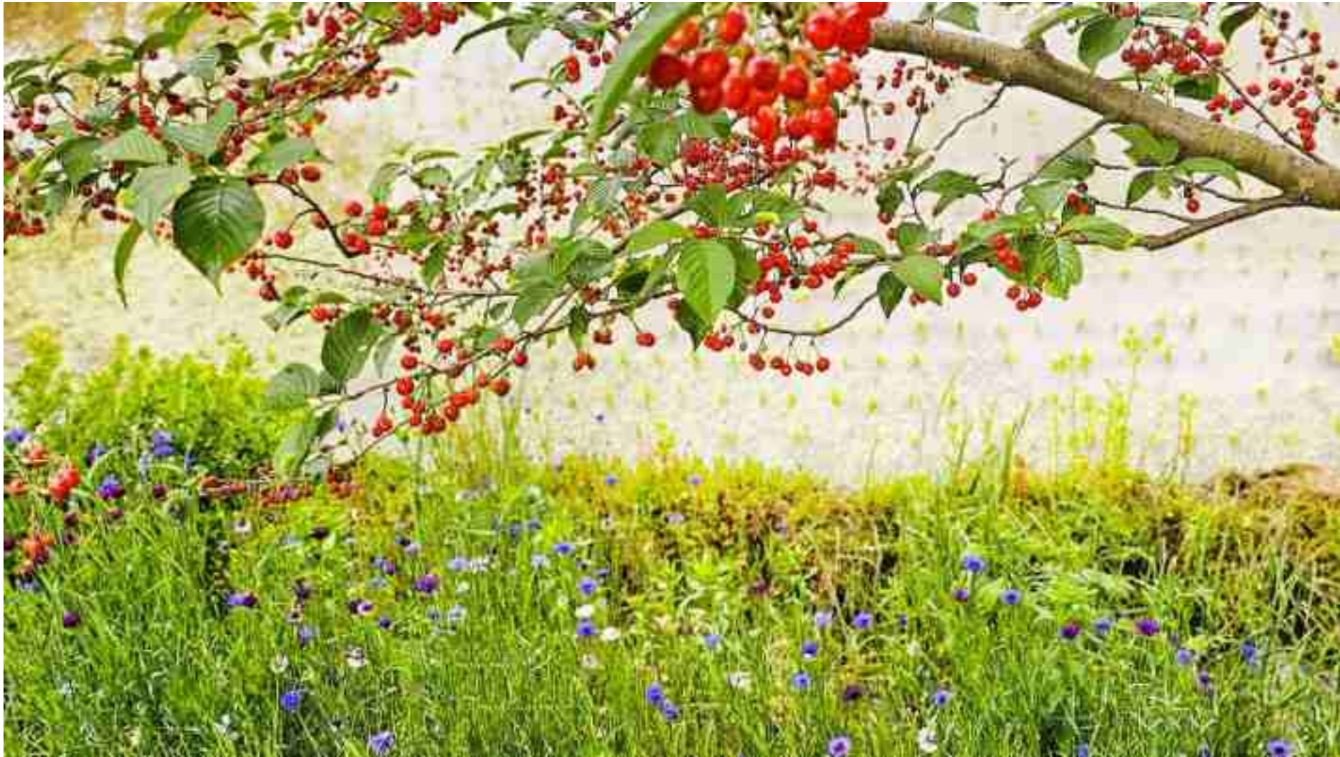
PSA HM RIBBON | KOREA PHOTO ART | COLOR OPEN (PIDC) (DIGITAL) | Rural landscape | Sungsook Choi | South Korea