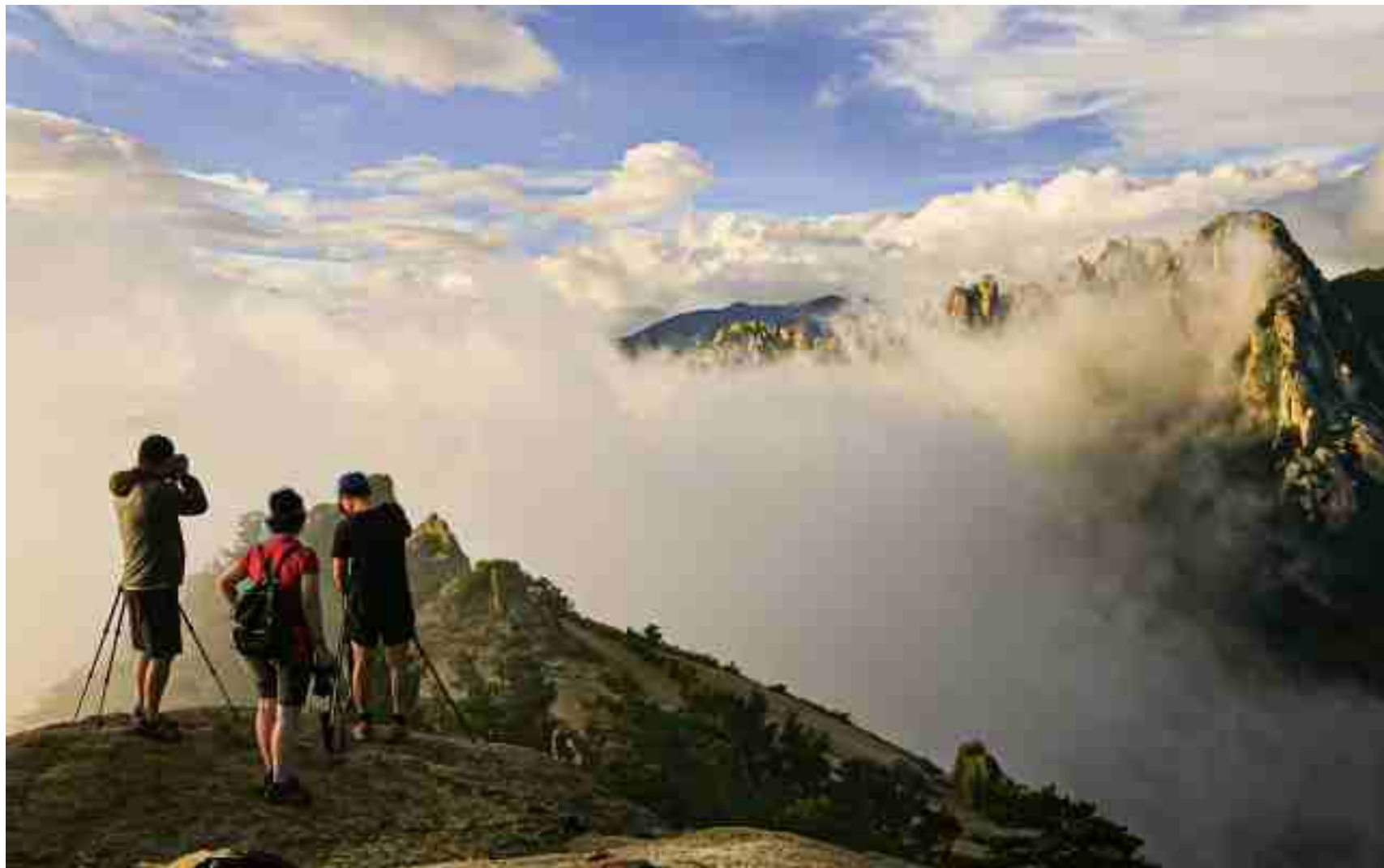
PSA HM RIBBON | KOREA PHOTO ART | PHOTO TRAVEL (PTD) (DIGITAL) | Top mountain | Gyeong Sook Seo | South Korea