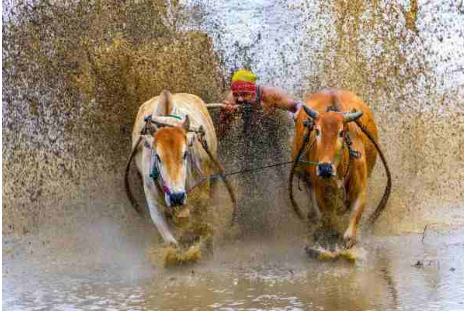
Club Gold | KOREA PHOTO ART | PHOTO JOURNALISM (PJD) (DIGITAL) | Water Buffalo Race 01 | YOUN JA JEON | South Korea