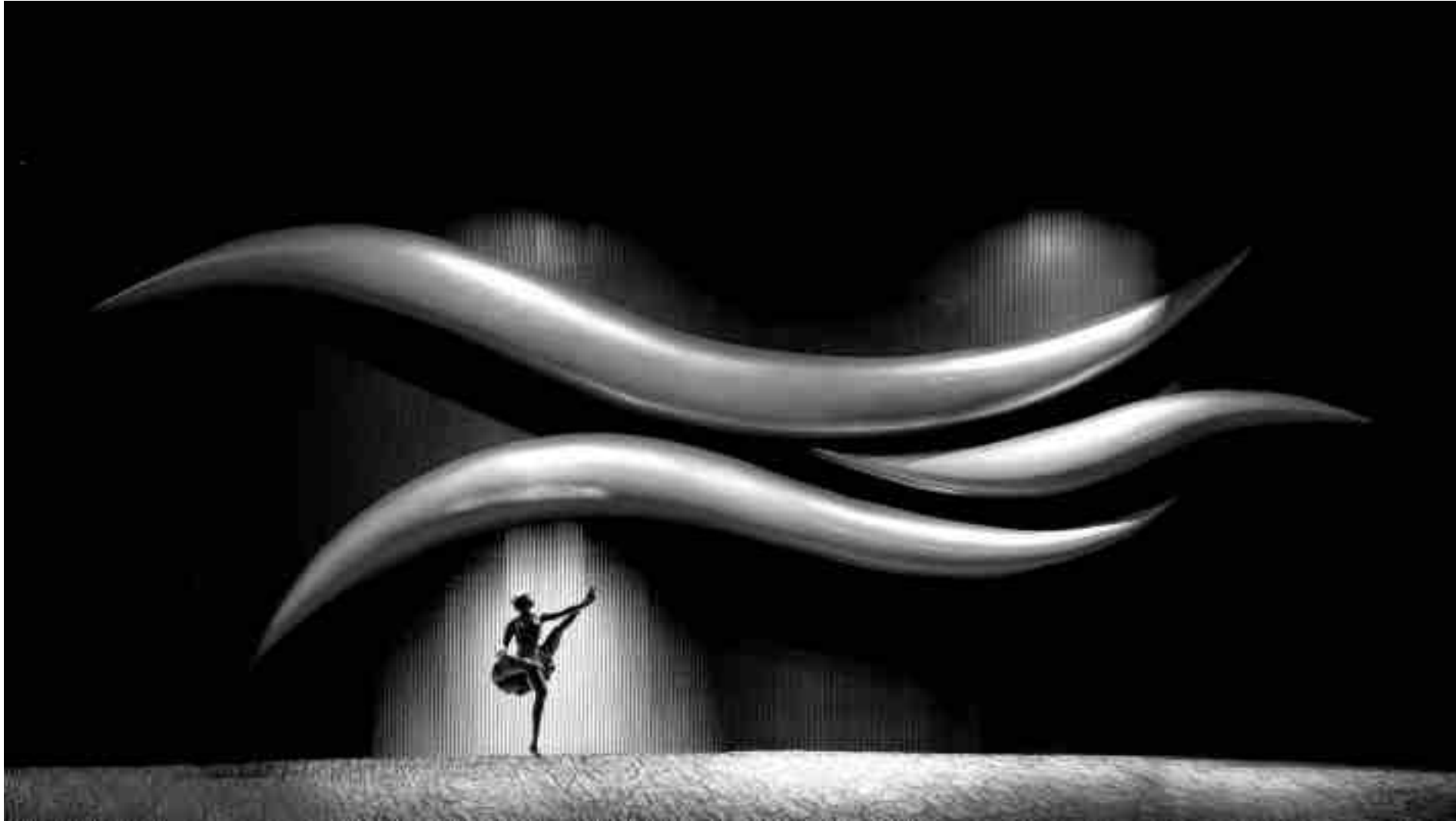
Club Bronze | KOREA PHOTO ART | MONOCHROME OPEN (PIDM) (DIGITAL) | Lines Images M40 | HW CHAN | Hong Kong