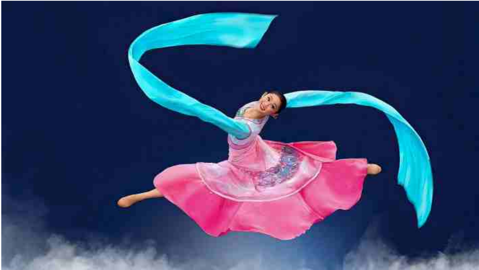
Club Bronze | KOREA PHOTO ART | COLOR OPEN (PIDC) (DIGITAL) | The place I dream of is | Aelok Bak | South Korea