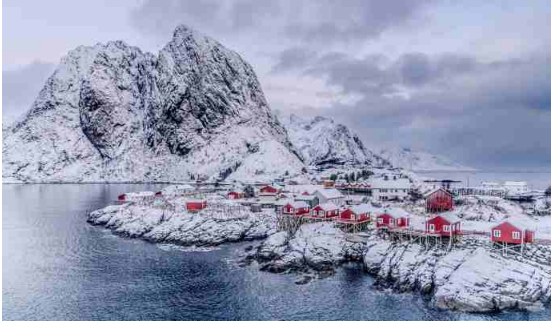
Club Gold | KOREA PHOTO ART | PHOTO TRAVEL (PTD) (DIGITAL) | Reine | Hosun Chae | South Korea