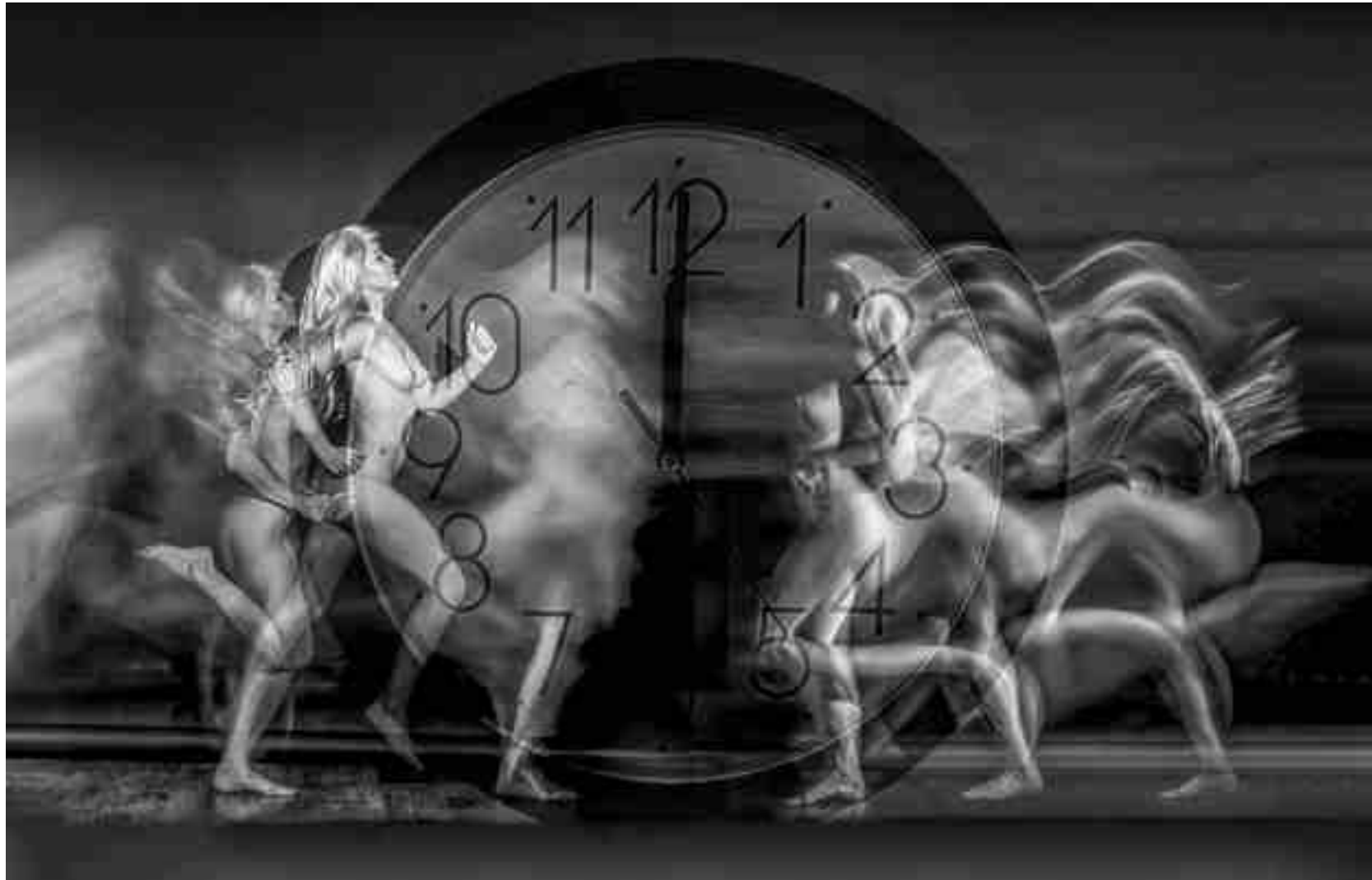
PSA Gold | KOREA PHOTO ART | MONOCHROME OPEN (PIDM) (DIGITAL) | Circuit of Time | Hae Jeong Choung | South Korea