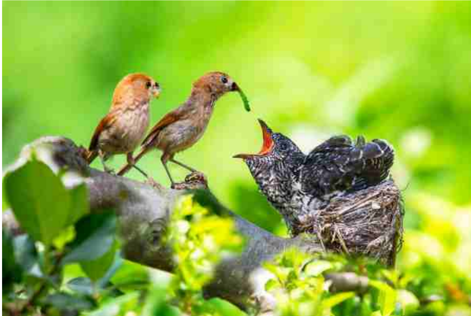
PSA HM RIBBON | KOREA PHOTO ART | NATURE (ND) (DIGITAL) | Brood Parasitism | SUNJA KWON | South Korea