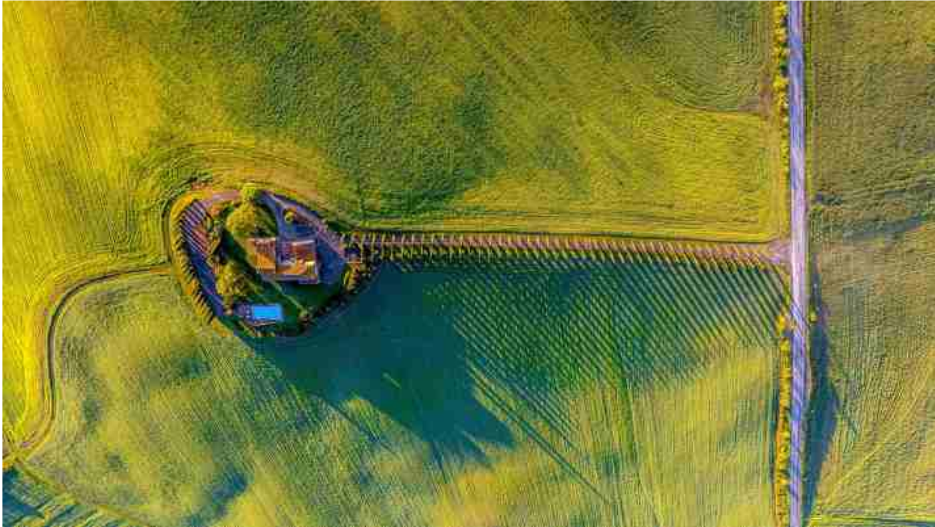
PSA Gold | KOREA PHOTO ART | PHOTO TRAVEL (PTD) (DIGITAL) | Agriturismo Poggio Covili | Young Chan Hyun | South Korea