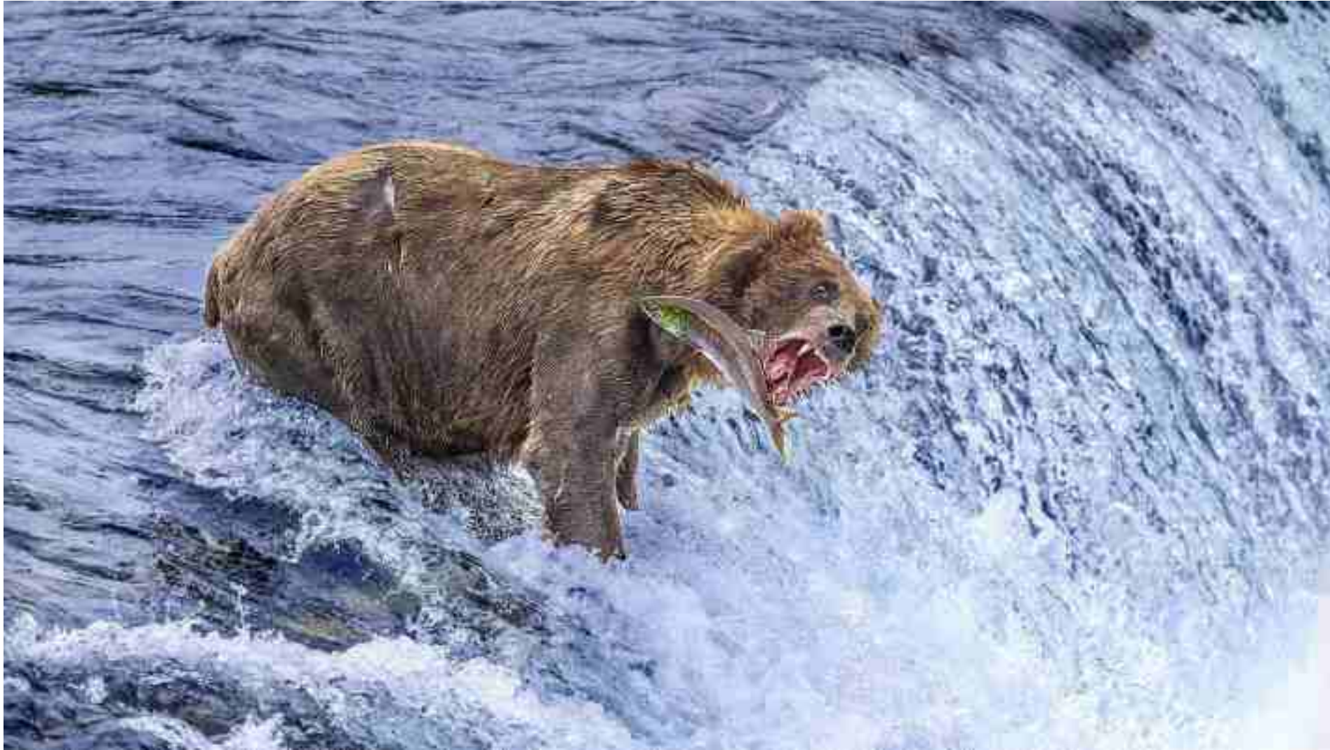
Club Bronze | KOREA PHOTO ART | NATURE (ND) (DIGITAL) | Brown Bear 1 Alaska | HW CHAN | Hong Kong