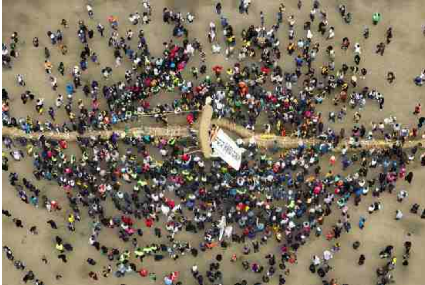
Diploma (PDF) | KOREA PHOTO ART | PHOTO JOURNALISM (PJD) (DIGITAL) | Tug of War Festival | EUN HEE LEE | South Korea