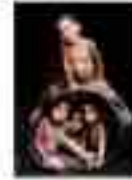
OC-Children playing 02