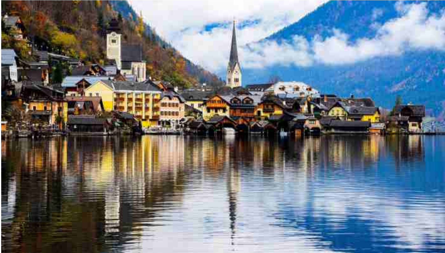
Club Bronze | KOREA PHOTO ART | PHOTO TRAVEL (PTD) (DIGITAL) | A lake morning 01 | GYEONG HEE BYEON | South Korea