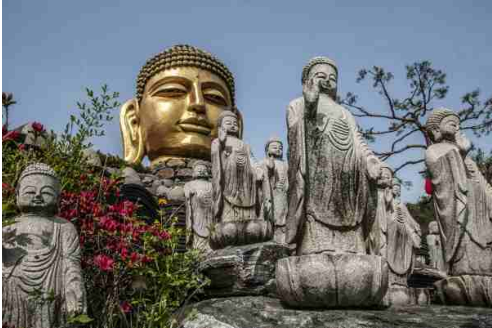
Diploma (PDF) | KOREA PHOTO ART | PHOTO TRAVEL (PTD) (DIGITAL) | Waujeongsa Temple | ChulSoo Park | South Korea